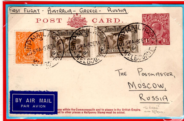
Ex Nelson Eustis – circa 3 flown to Russia

Postcard rate Australia – Russia 1s 2d. Superscription required: 'Australia-Greece-Russia'