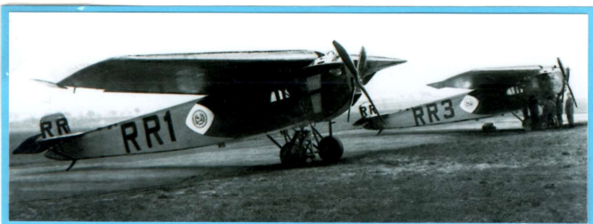
DERULUFT Fokker F.III's at Khodinka Airport, Moscow, May 1922 ready to start the service to Königsberg.

PLAN: The exhibit is shown generally in chronological order within the following sections: